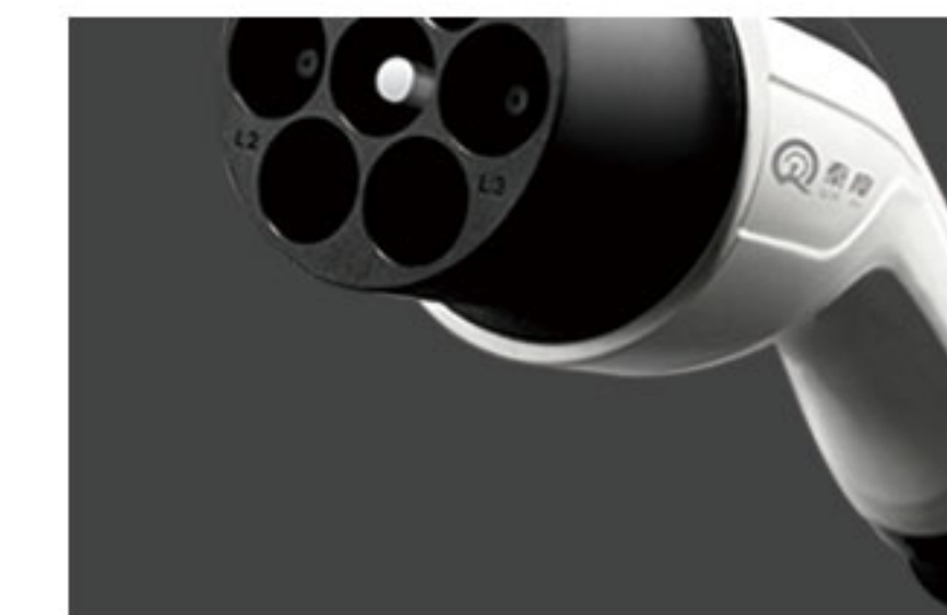
☞ Silver plated gun head