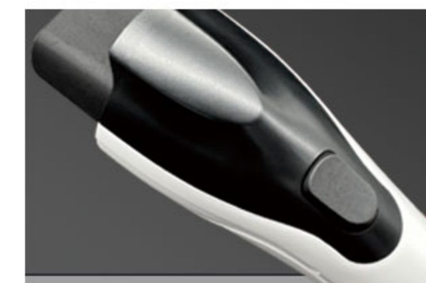
◎ Ergonomic buttons